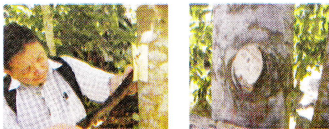
Figure 3. Preparation for making fungi infection (left) and gaharu tree has contained gaharu resin (right)

Some trees very early but the other did not infected until teen aged depend on environment. Not all of planted gaharu trees producing gaharu resin, therefore, before harvesting should be checked the existing of gaharu resin.