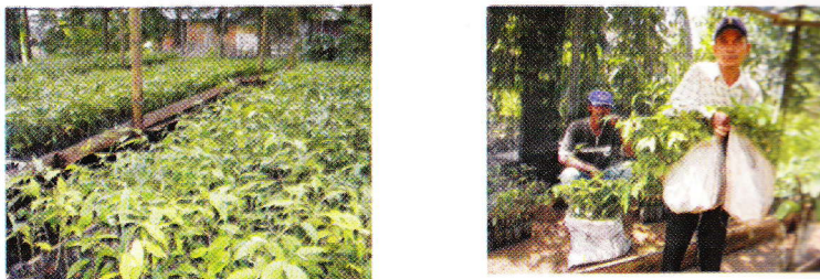
Figure 1. Gaharu seedlings and farmers bringing some gaharu seedlings