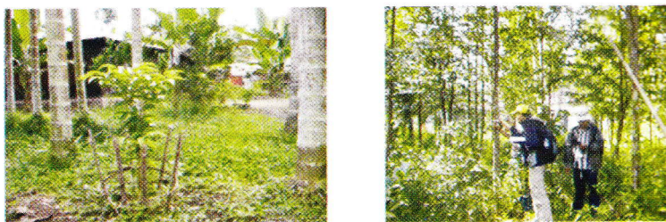
Figure 2. Gaharu trees after 8 months (lefts) and 4 years transplanting (right)

In July 2007, after more than 2 years transplanting, the height ranged from 150-300 cm with stem diameter of 4-7 cm. The growth speed of plants depend on soil fertility and maintenance of farmers. Gaharu planted in planting hole containing compost with good cultivation usually grow well. Seeing good performance of gaharu trees, some farmers such as Mr. Oman, grow more additional gaharu plants in his home garden. Now more than 100 gaharu trees growing in Mr. Oman home garden.