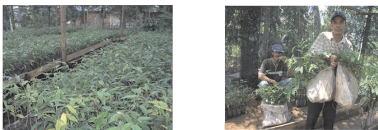
Figure 1. Gaharu seedlings and farmers bringing some gaharu seedlings