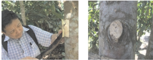
Figure 3. Preparation for making fungi infection (left) and gaharu tree has contained gaharu resin (right)

then burning the gaharu wood. Usually the first infection is around the branches. If wood burning and release specific gaharu resin aroma, it mean that the process of accumulation of gaharu resin is going on. The beginning of gaharu trees infected by fungi were not similar. Some trees very early but the other did not infected until teen aged depend on environment. Not all of planted gaharu trees producing gaharu resin, therefore, before harvesting should be checked the existing of gaharu resin.