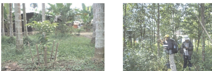
Figure 2. Gaharu trees after 8 months (lefts) and 4 years transplanting (right)

In July 2007, after more than 2 years transplanting, the height ranged from 150-300 cm with stem diameter of 4-7 cm. The growth speed of plants depend on soil fertility and maintenance of farmers. Gaharu planted in planting hole containing compost with good cultivation usually grow well. Seeing good performance of gaharu trees, some farmers such as Mr. Oman, grow