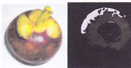
Figure 2 Physical damage on mangosteen (a) broken calyxes; (b) dented rind

The physical damage that occurred in fruits arranged with fcc pattern was only in the form of dented rinds, while the physical damage to the fruit arranged in a Jumble pattern experienced broken calyx and dented rind. Condition of complete calyxes is one of the quality parameters of mangosteen fruit that taken into account in international market. Therefore, the fcc packing pattern can be applied to avoid broken calyxes on mangosteen transportation.