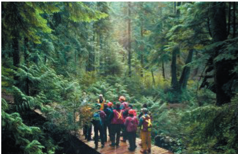
UBC forestry students