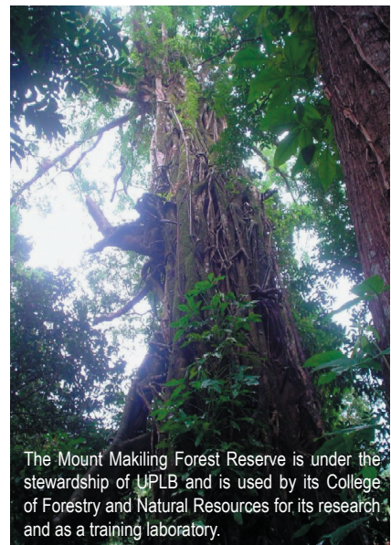
The Mount Makiling Forest Reserve is under the stewardship of UPLB and is used by its College of Forestry and Natural Resources for its research and as a training laboratory.

The revised curriculum introduces a required course on entrepreneurship to better equip forestry graduates as generators of employment. Courses on emerging technologies, including Geographic Information System (GIS) and watershed management, have been also been included as core courses. The new curriculum likewise reflects a shift towards utilization of non-timber forest products like bamboo, resin, and rattan.