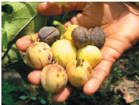
Jathropa fruits

Jathropa curcas , an erstwhile insignificant tropical plant that thrives in marginal soil unsuitable for food crops, has captured the world’s attention as one of the best sources of biofuel. Jathropa is unique in that oil from its seed can be used as biodiesel for any diesel engine without modification.