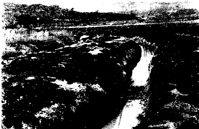
Figure 1. A sweet potato wetland garden on the floor of the Baliem valley. Raised beds are surrounded by water-filled ditches that form a closed canal network.

A new collective garden, is usually derived from a forest or an old garden that has been abandoned for 5 to 7 years. The new garden is prepared according to a sequence of traditional practices which can be categorised as the activities to prepare a garden and the activities to maintain both the garden and the sweet potatoes grown in it. The first activities are to clear the forest or the old garden, to dig ditches and build raised beds with soil taken from the ditches. The ditches form a closed canal network and connect the main canal to a nearby river. Then, the farmers cut grasses that grow in this land, spread them evenly on the surface of the raised beds and burn them after