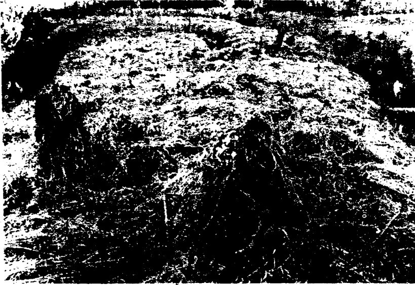
Figure 2. Grasses are cut and spread evenly on the surface of a raised bed to dry and then the grasses were burnt.