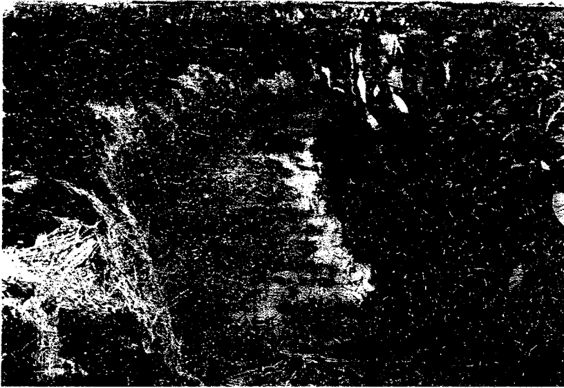
Figure 5. Planting seasons are carried out in parallel. Sweet potatoes and taros grown on the right-hand bed will soon be ready for harvesting. A raised bed on the left-hand side is being prepared for a new planting, for which the mud layer in the ditch is provided.