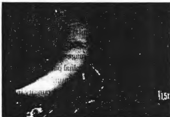
Fig. 1 Alloplastic spermatocele construction

Wives were down-regulated with gonadotropin-releasing hormone (GnRH) analogue (Sprecur; Hoechst Marion Roussel, Tokyo, Japan) and ovarian superovulation was performed by administering human menopausal gonadotropin (hMG, Humegon; Organon, Holland) and pure follicle-stimulating hormone