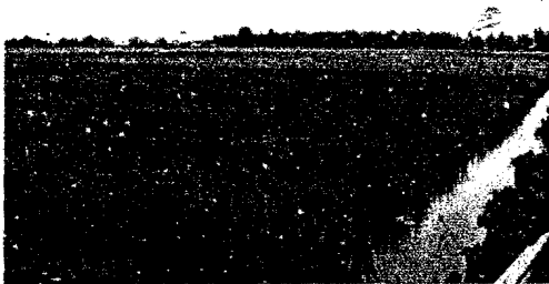
Figure 2. Rice growth in pilot project was not uniform due to different transplanting time and farmer management.

The preparation of seedling was done in September in order the transplanting can be conducted in October. According to the previous experiment, the dosage of fertilizers is as follows: urea = 100 kg/ha, SP36 = 100 kg/ha, KCl = 100 kg/ha, and MgSO_4 = 50 kg/ha. The micronutrient fertilizer at the rate of 3 liter/ha were applied through foliar application. Weeds were controlled manually. Pest and diseases are controlled by spraying of fungicides and insecticides if pest or diseases were above the economical threshold.