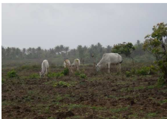
Cows Reared in Desa Ujung Genteng