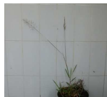
Chrysopogon aciculatus (Retz.) Trin.