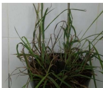
Eulalia leschenaultiana (Decne.) Ohwi