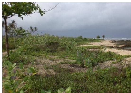
The Condition of Desa Ujung Genteng's Beach