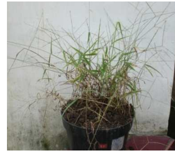
Digitaria sanguinalis (L.) Srop