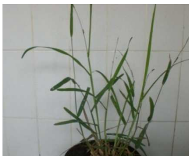
Panicum geminatum Forssk.