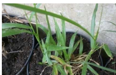
Brachiaria distachya (L.) Stapf.