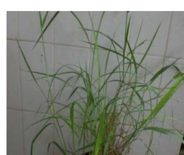
Brachiaria subquadripara (Trin.) A.