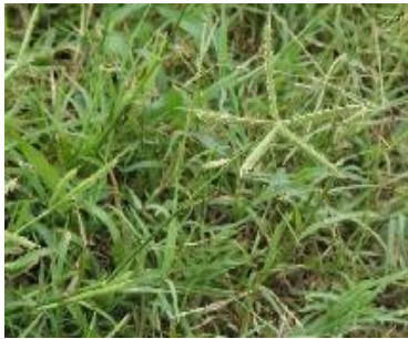
Dactyloctenium aegyptium (L.) wild