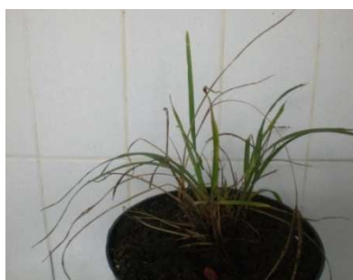
Eleusine indica (L.)