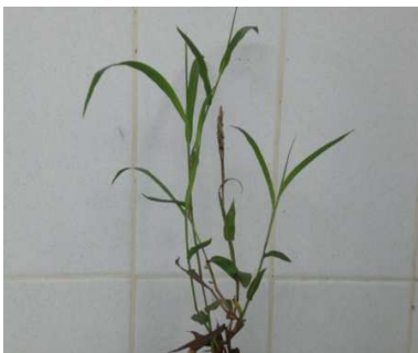
Ischaemum muticum (L.)