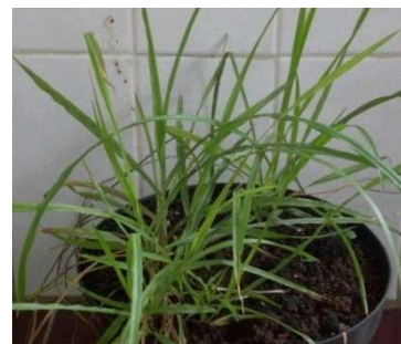
Chloris barbata Swartz.