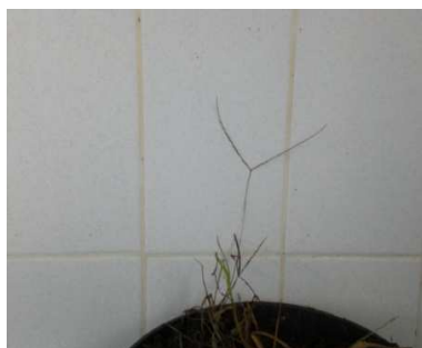
Themeda triandra Forssk