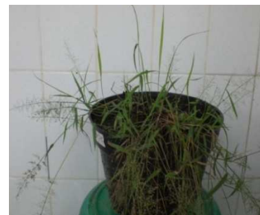
Eragrostis unioloides (Retz.) Nees ex Steudel