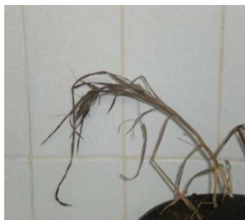
Digitaria nuda Schumacher