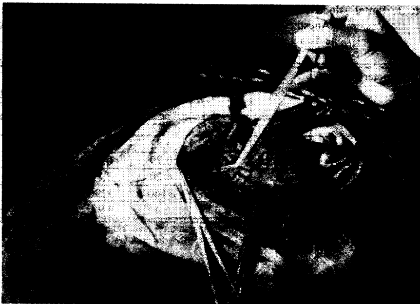
Fig. 2. Position of the Right Ruminal Vein where the Infusion Cannula is Placed for Portal Blood Flow Measurement by the PAH-Method