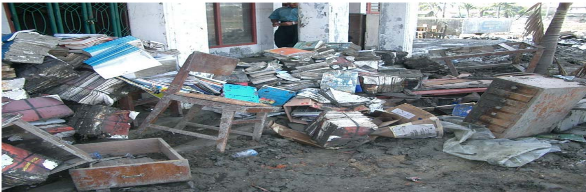
Fig.1 The condition for the Library of SMK Banda Aceh resulting from the tsunami 2004

The condition of library buildings are still intact, a collection of 10,000 copies was completely destroyed, can not be used again, while remaining under water and mud. 1440 the number of students, who reported 650 people. The number of 95 teachers and 14 teachers' honorarium, which lost 15 people including school principals, Drs. D. D. Iskandar, MSc.