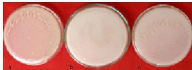
Fig 3 Regaining of Pi-solubilizing ability of isolate A induced by gradual addition of Pi in Pikovskaya medium. (a) initial Pi concentration (50%); (b) defined Pikovskaya medium (100%); (c) 25% Pi addition.