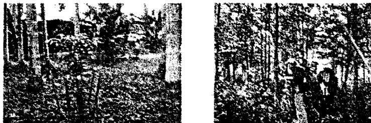
Figure 2. Gaharu trees after 8 months (lefts) and 4 years transplanting (right)

In July 2007, after more than 2 years transplanting, the height ranged from 150-300 cm with stem diameter of 4-7 cm. The growth speed of plants depend on soil fertility and maintenance of farmers. Gaharu planted in planting hole containing compost with good cultivation usually grow well. Seeing good performance of gaharu trees, some farmers such as Mr. Oman, grow more additional gaharu plants in his home garden. Now more than 100 gaharu trees growing in Mr. Oman home garden.