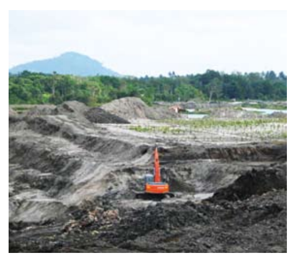
Tailing off: Tin mine tailings are inhospitable to tree regeneration and growth

There was a significant interaction between planting density and soil treatment on survival rate, plant cover, and litter production. The combination treatment of highest planting