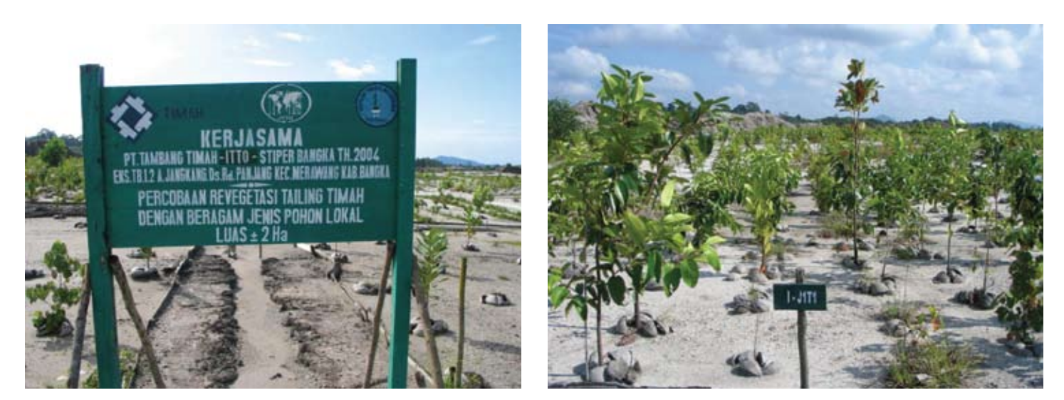
Greened: Study site shortly after planting (left) and at fourteen months after planting (right)

There were 41 invading species recorded on plots with a domination of species from Cyperaceae, Melastomataceae, Leguminosae, and Poaceae families. As plots treated with top soil plus legume cover crops showed the highest number of invading species, top soil appeared to be the primary seed source (Zhang et al. 2001). Comparing parameters of soil properties, the number of tree species, total number of plant